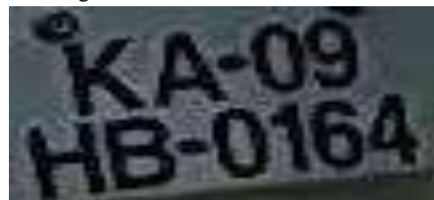
Fig. 7: License plate extraction and rotation

Using the trained model, the bounding box is created across license plate in given input image. The corresponding information includes top-left, bottom right co-ordinates of bounding box, class name, confidence of detection in a .json file. Then to extract the license plate image only, the bounding-box co-ordinates stored in .json file are used and extracted images are stored. Sometimes, as shown in Fig. 6, for a single motorcycle image, more than one bounding box were detected. In that case, a threshold of 0.5 is set for confidence of detection. While reading details of bounding box in the .json file, the one with confidence greater than the threshold is chosen.