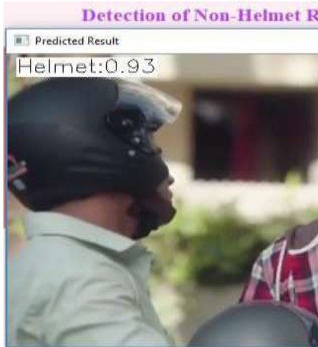
Fig. 4: Helmet detection

Once the person-motorcycle pair is obtained, the person images is given as input to helmet detection model. While testing the helmet detection model, some false detections were observed. So, the person image was cropped to get only top one-fourth portion of image, as shown in Fig. 4. This ensures that false detection cases are eliminated as well as avoid cases leading to wrong results when the rider is holding helmet in hand while riding or keeping it on motorcycle while riding instead of wearing. After applying cropped image to helmet detection model, output is as shown in Fig.4. The bounding box around helmet along with the detection probability is displayed as shown in Fig.4. As the rider wearing helmet in Case 1, no further processing is necessary. Since in Case 2, rider is not wearing helmet, no bounding box is created.