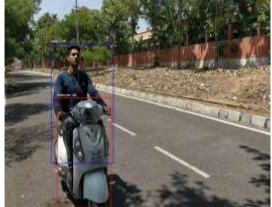
Fig. 2 (b): Frame with ‘person’ and ‘motorcycle’ classes detected (Case 2)