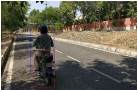
Fig. 1 (a): Frame with ‘person’ and ‘motorcycle’ classes detected (Case 1)

The frame chosen is given as input to YOLOv2 object detection model, where the classes to be detected are Motorbike“, „Person“. At the output, image with required class detection along with confidence of detection through bounding box and probability value is obtained as shown in the Fig. 1 (a) and Fig. 1 (b).