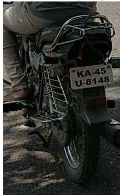
Fig. 3 (a): Extracted motorcycle and person images (Case 1)

With the help of functions given by Image AI library, only the detected objects are extracted as shown in Fig. 3 (a) and Fig. 3 (b) and stored as separate images and named with class name and image number in order. For example, it will be saved as motorcycle- 1, motorcycle-2, etc.... if extracted object is motorcycle or person-1, person-2, etc.... if extracted image is of person. The details of these extracted images which is stored in a dictionary which can be later used for further processing.