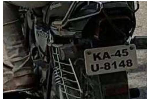
Fig. 6: License plate detection

should this patient be operated on, and if so, what should be the extent of resection.