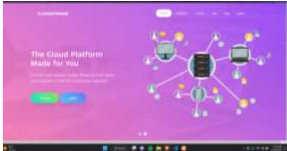
fig.7. 1 uploading of dataset