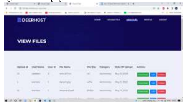
fig.7.2 view files