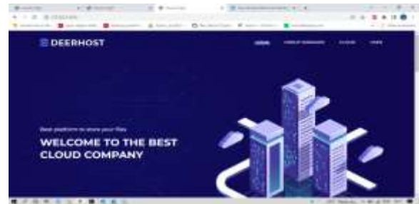
fig.7. 1 Home page