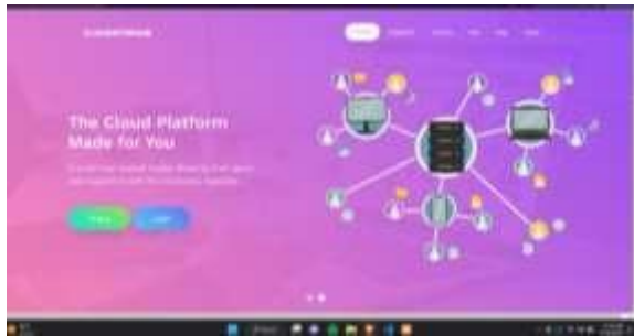
fig.7.1 uploading of dataset