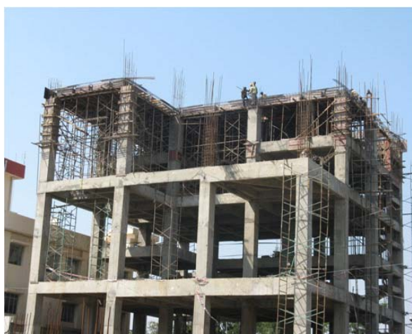
Figure 1: RCC Frame Work