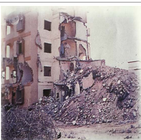
Figure 5: Failure During Earthquake of Building

Properly planned architectural layout plays an important role in the structural stability. If the layout is not suitable, then it can cause structural