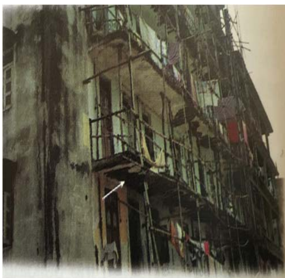
Figure 6: RCC Balcony

cantilever RCC slabs of balconies have deteriorated.