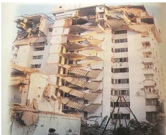
Figure 3: Collapse of Building