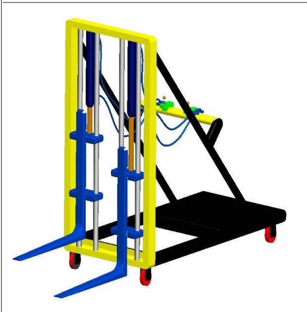
Figure 3: Fork Lift