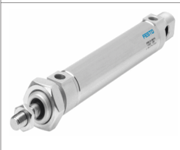
Figure 4: Cylinder

Double-Acting Cylinders (DAC) use the force of air to moves in both extends and then retract strokes. They have been two ports; allow air in one for out of stroke and one for stroke. In this design fork length is not limited; however, the fork length has varied as piston rod is more vulnerable to a buckling and bending.