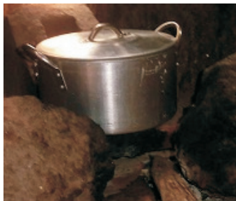
Plate 3: The Charcoal Stove