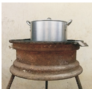
Plate 3: The Charcoal Stove